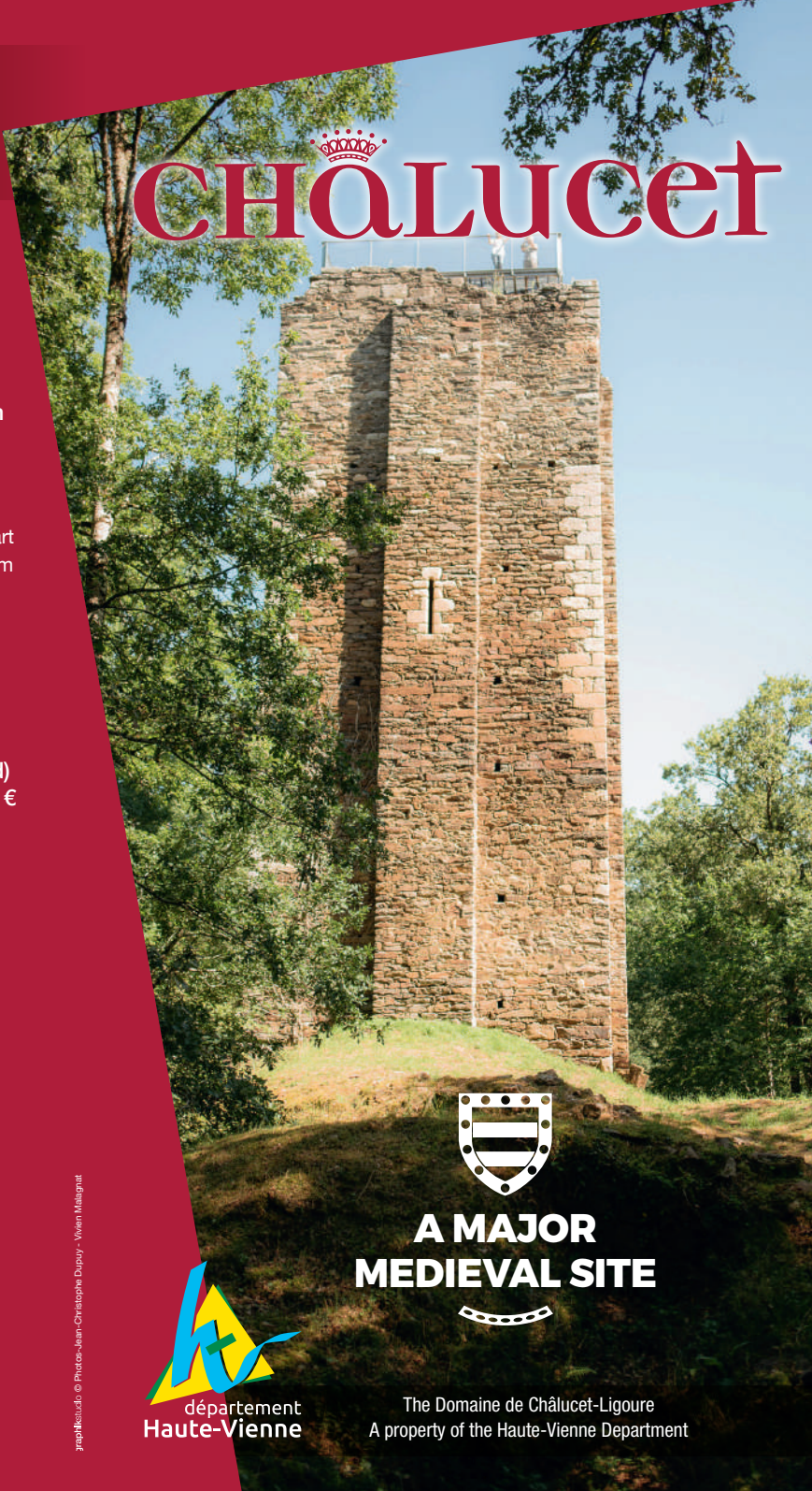
graphikstudio © Photos: Jean-Christophe Dupuy - Véron Maignat